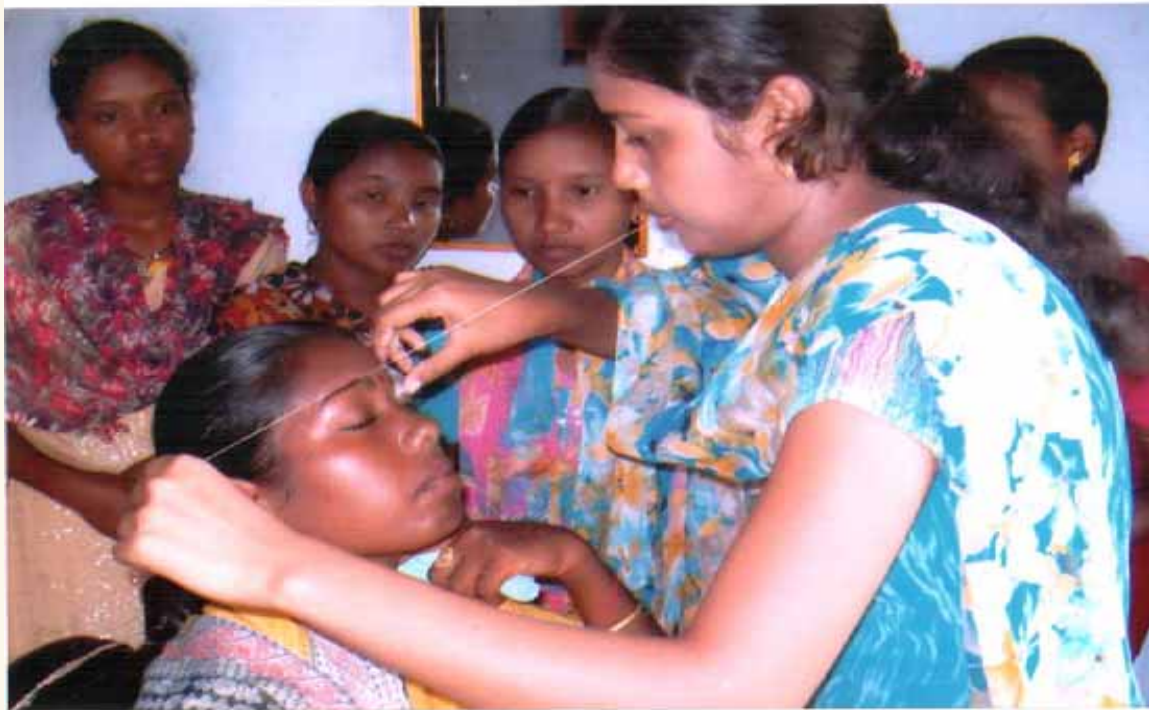
Beauty Culture & Health Care Training Programme