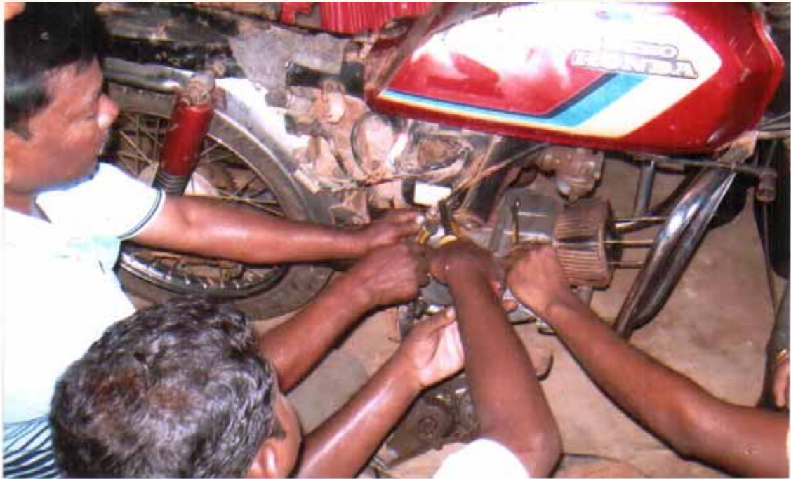
Two Wheeler Mechanism Training Programme